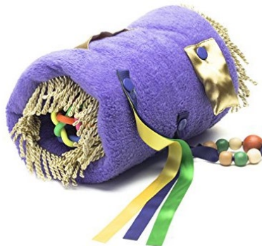
Twiddle Classic Fidget Blanket - $50