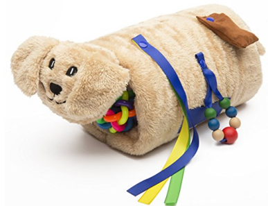
Twiddle Pup Fidget Blanket - $50