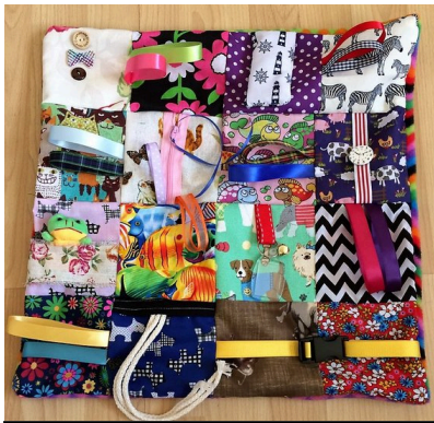
Fidget Blanket - $30.93

Sometimes known as activity blankets, fidget blankets are tools used to help provide sensory and tactile simulation for people living with Alzheimer's, Dementia, Autism, and other ailments that require developing and actively maintaining fine motor skills. Companies such as Twiddle make a variety of blankets, while individual vendors can custom-create blankets focusing specifically on what skills the individual would like to focus on.